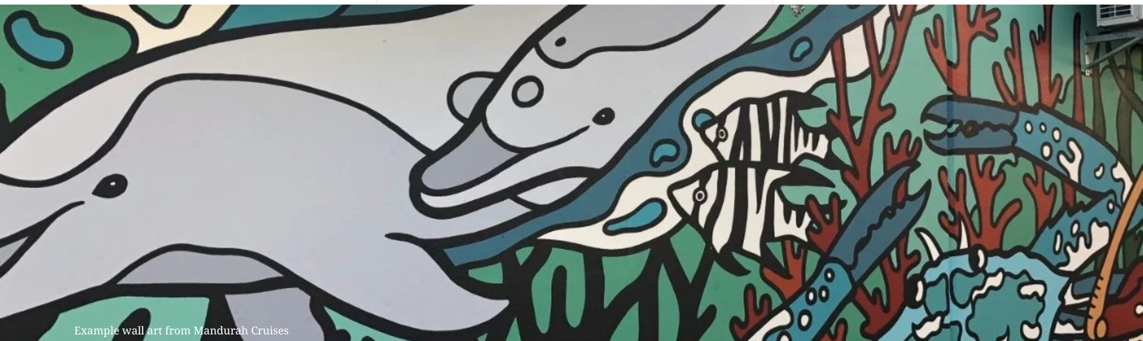
Example wall art from Mandurah Cruises

“Together we can improve our environment to the benefit of our wildlife and residents”